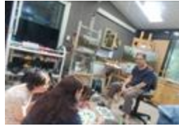
Family - May 17, 2025 at 08:30 PM