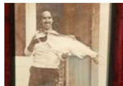
Family - May 17, 2025 at 05:17 PM