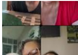
Family - May 17, 2025 at 08:24 PM